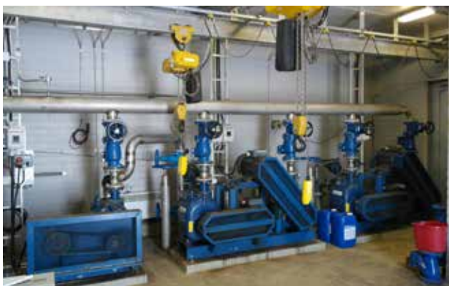
EKJH pump station and remote view in Flowrox Malibu™.

“We chose Flowrox because they offered us the best service,” says Sami Huotari, Site Manager at EKJH. They have continuous support from Flowrox professionals even after installations. Flowrox solution is saving EKJH lots of valuable time, has significantly increased safety and optimized operation of pump station.